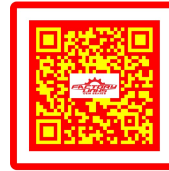
Gas Gas Catalogue

To access the most up to date Sherco model listing and Factory-Links fitment guide please scan the QR code on the side of the page.