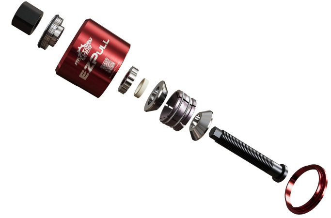
Steering Stem Bearing Tool

DUST SEALS: Designed to match each type of tapered bearing and steering column to assure the best containment of the dust and water. Dust seals are made of Nitrile Butadiene Rubber and strictly moulded to exact OEM specifications. The seals prevent abrasives, corrosive moisture and other harmful contaminants from entering bearings.