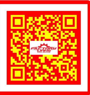
Gas Gas Catalogue